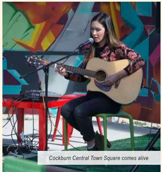
Cockburn Central Town Square comes alive

Keep up with the Cockburn Central story by visiting www.cockburncentral.com.au or follow us on Facebook at www.facebook.com/cockburncentraltowncentre