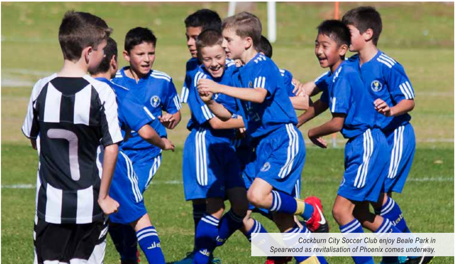
Cockburn City Soccer Club enjoy Beale Park in Spearwood as revitalisation of Phoenix comes underway.

For a more detailed update on the Revitalisation Strategy please visit the City's website at: www.cockburn.wa.gov.au/PhoenixCentral