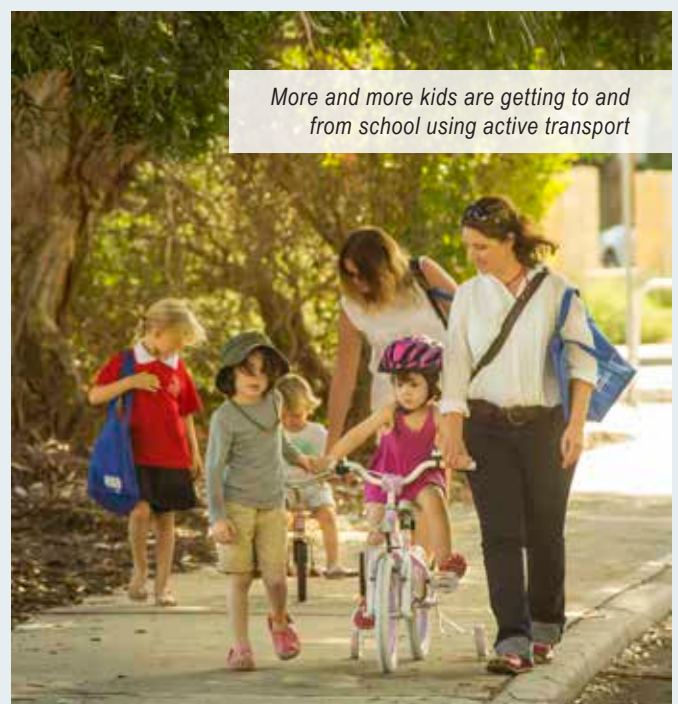
More and more kids are getting to and from school using active transport

TravelSmart: www.beactivecockburn.com.au/travelsmart/