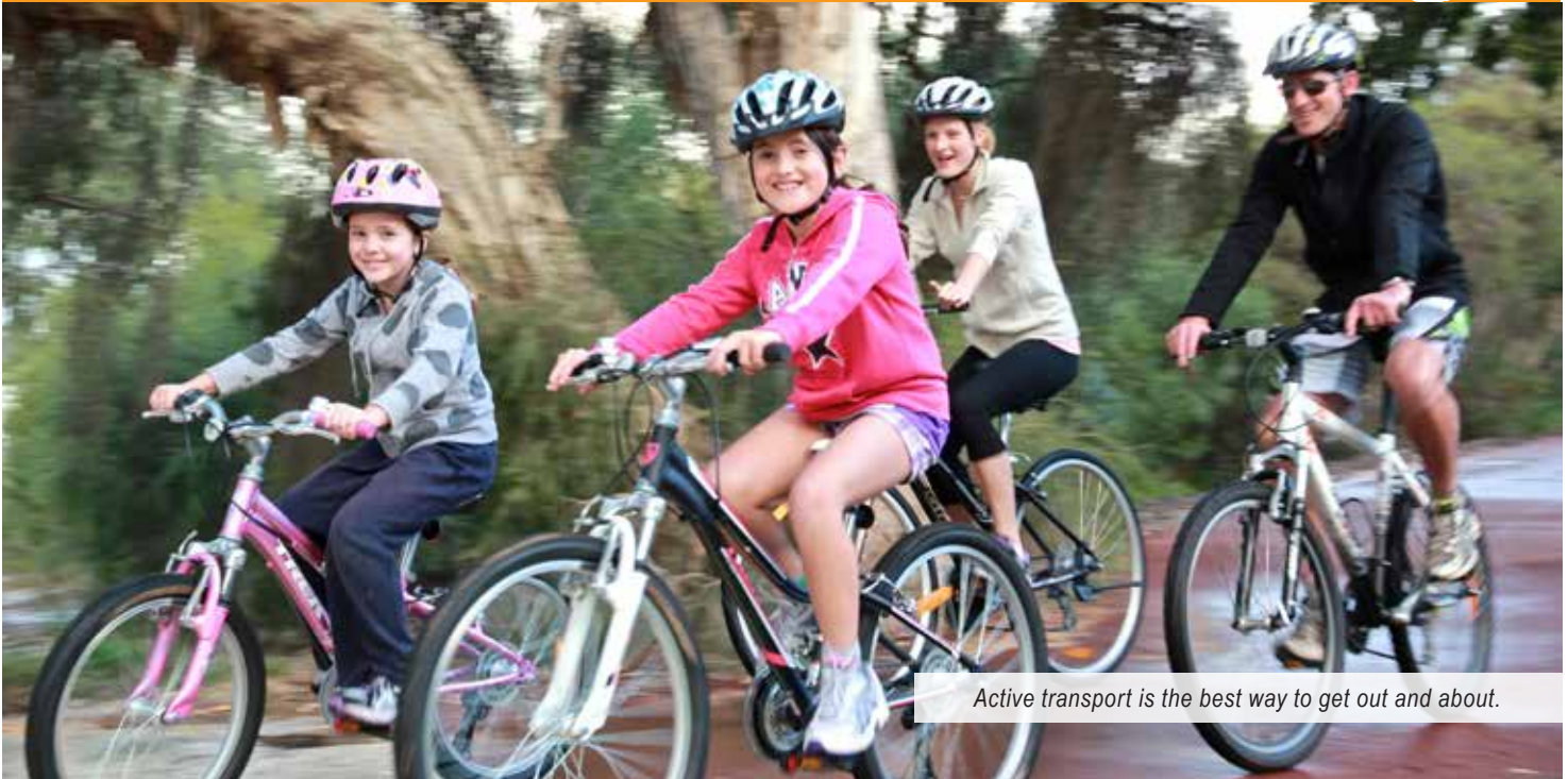
Active transport is the best way to get out and about.

People living in the City of Cockburn are being encouraged to lead more active lifestyles as part of the new Your Move service.