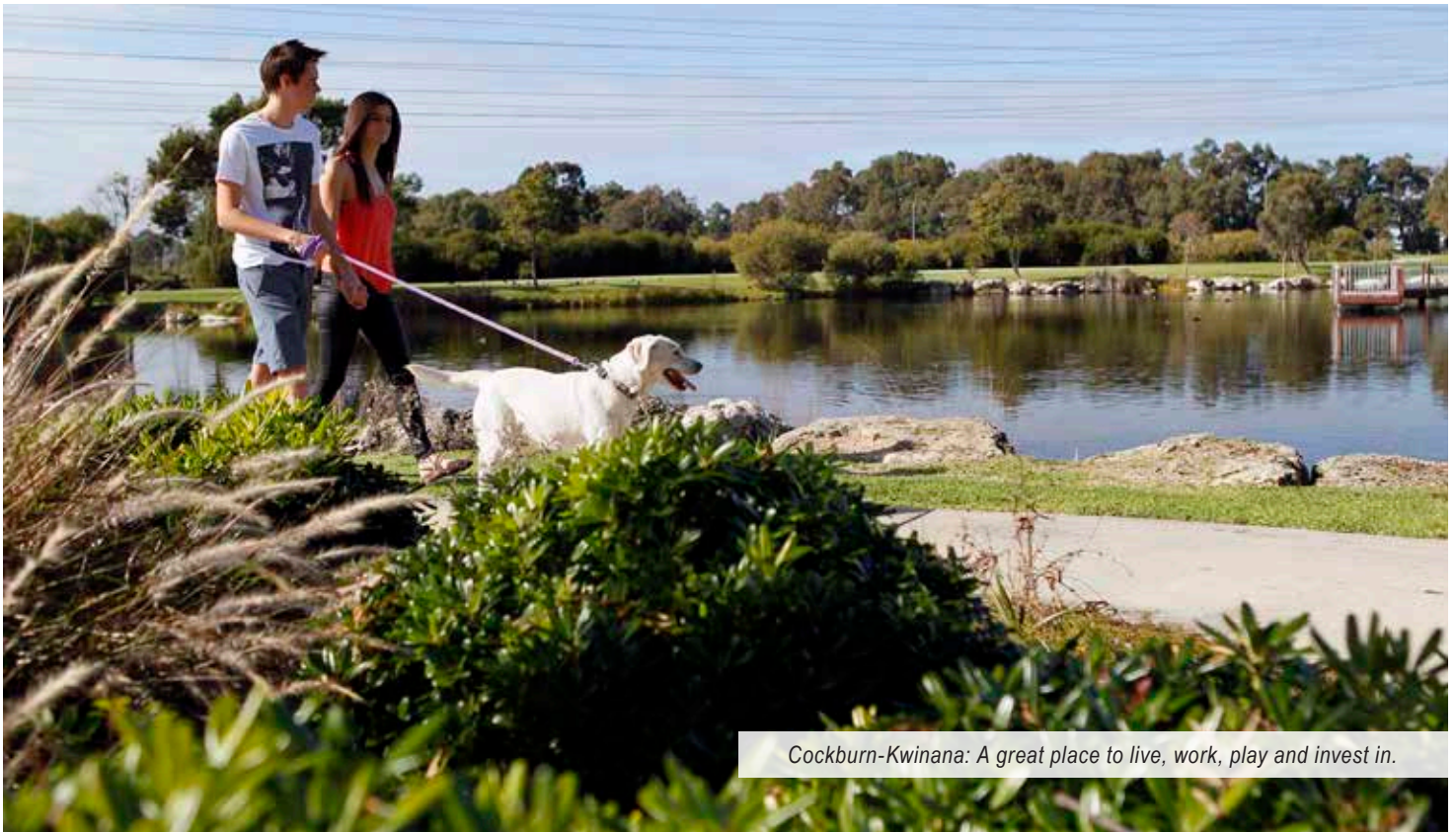
Cockburn-Kwinana: A great place to live, work, play and invest in.

The City will keep the community informed as we move towards this deadline. Cockburn rate payers and residents will be assured that service delivery standards will be maintained.