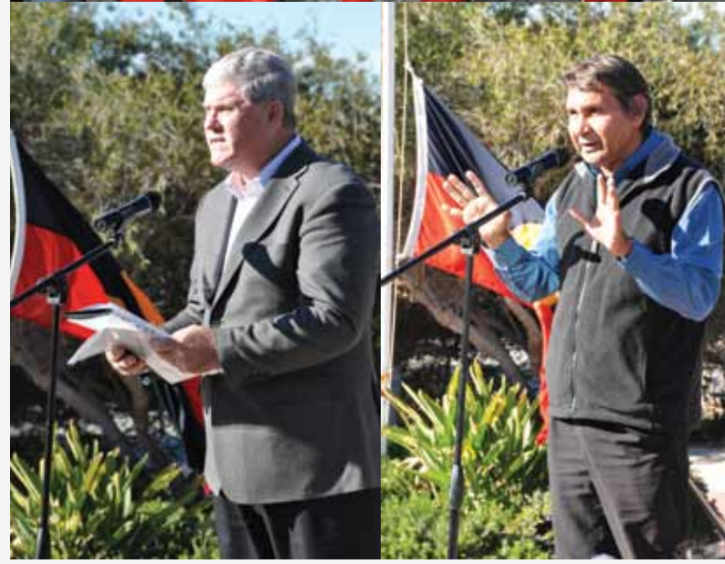
Caption Mayor Logan Howlett opens the NAIDOC Flag Raising Ceremony on Wednesday 7 July.