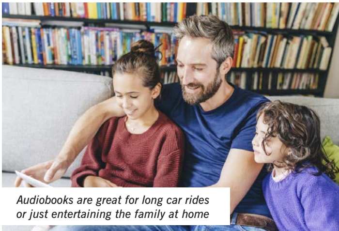
Audiobooks are great for long car rides or just entertaining the family at home

We have a range of eBooks and eAudiobooks for children – download and enjoy them today! The audiobooks are very good for long car rides and for general family entertainment. Other eResources to checkout include Tumblebooks and Literacy Planet .