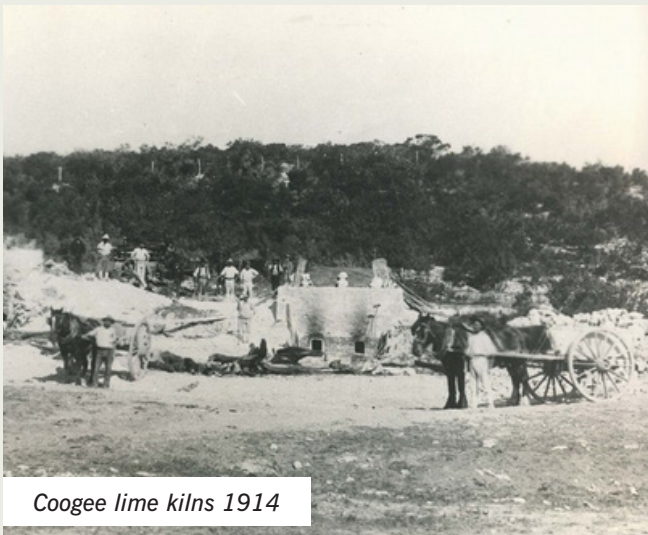
Coogee lime kilns 1914

With booming business came human drama, and over the years at least two Coogee lime workers committed suicide with dynamite used for quarrying. Nevertheless, in the 1920s the kilns boasted 60 men working round the clock. With the opening of new quarries in Wanneroo in the 1930s and the depletion of material in Coogee, the lime boom came to a slow end. But the industry lives on in the form of Cockburn Cement, which opened its doors in 1955.