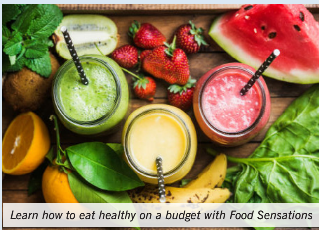
Learn how to eat healthy on a budget with Food Sensations

For information about Food Sensations and other healthy lifestyle programs run by the City of Cockburn, visit beactivecockburn.com.au or call 08 9411 3444.