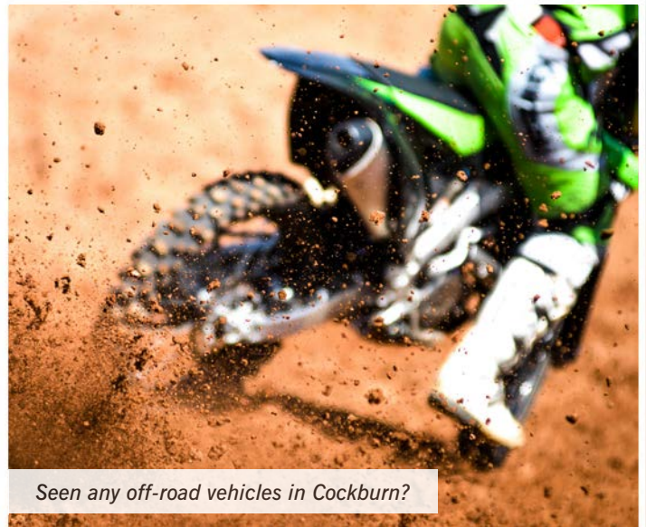
Seen any off-road vehicles in Cockburn?