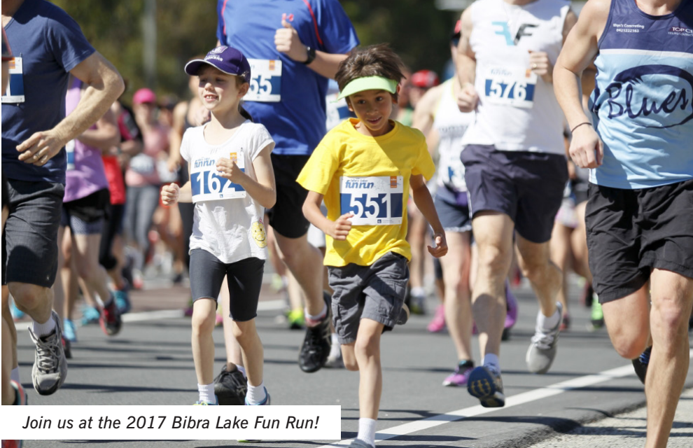
Join us at the 2017 Bibra Lake Fun Run!

The annual City of Cockburn Bibra Lake Fun Run will be held on Sunday 5 November starting at 9am. The 6km course is suitable for all abilities. Prize money is awarded to the top three male and female placegetters in four age categories.