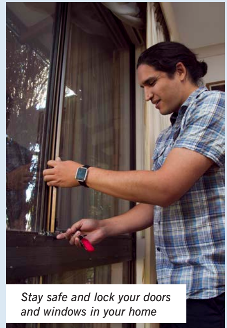
Stay safe and lock your doors and windows in your home

For further information visit cockburn.wa.gov.au/homesafetytips , call 08 9411 3444 or email customer@cockburn.wa.gov.au