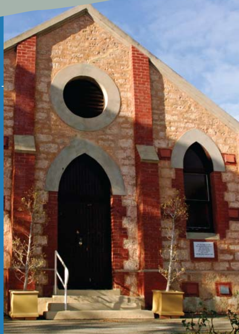
Mell Rd. Spearwood

For more information please contact the City on 94113444.