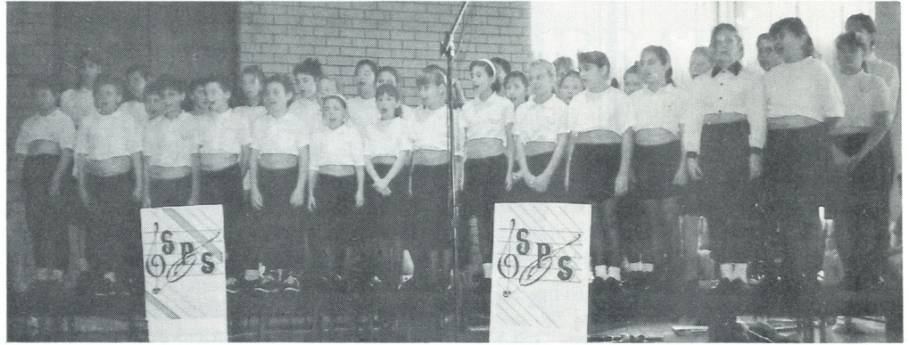
■ In perfect harmony . . . Spearwood Primary School choir.