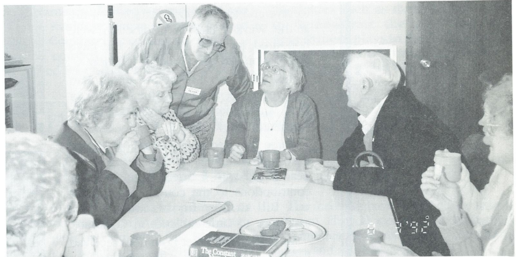
■ Enjoying a good book and a cuppa at Joe Cooper.

Detailed management proposals have yet to be worked out but a committee has been established to ensure that the management of each small portion of the park will match the overall concept. A copy of the report can be viewed at the the Council offices or at the Department of Planning and Urban Development at Albert Facey House in Forrest Place.