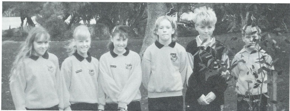
■ Local schoolchildren at the tree-planting ceremony.