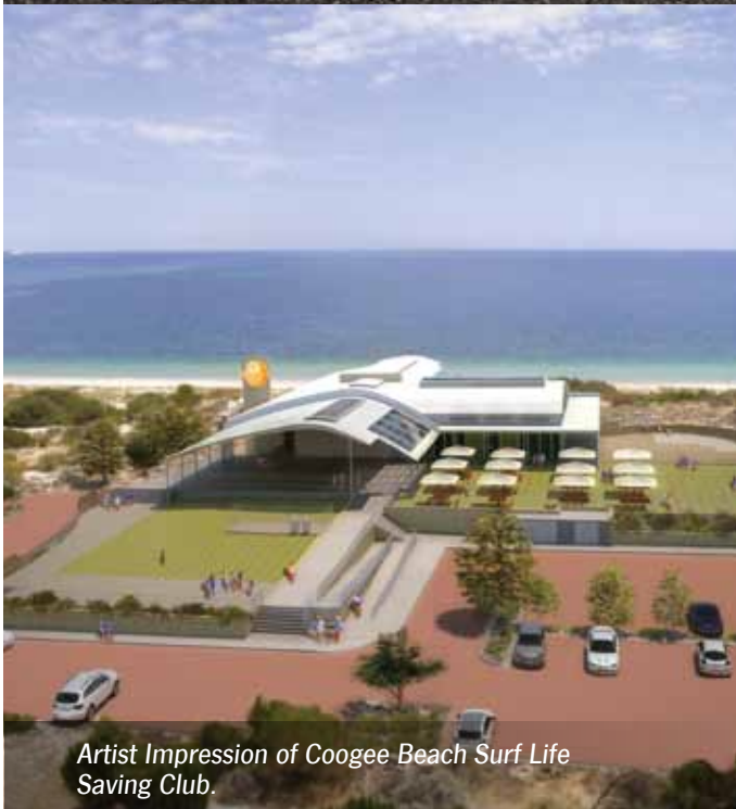
Artist Impression of Coogee Beach Surf Life Saving Club.