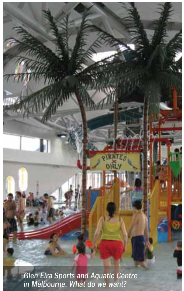
Glen Eira Sports and Aquatic Centre in Melbourne. What do we want?

The centre will be the largest investment the City has undertaken in community facilities. It will be funded from municipal funds, with grant funding also being sought from the Federal and State Governments.