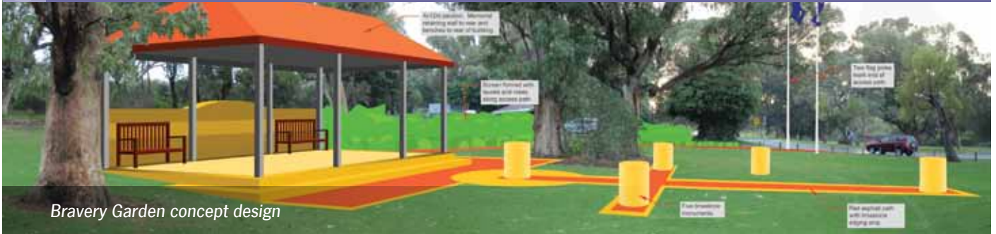
Bravery Garden concept design