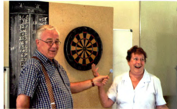
The Atwell Over 50's Club now meets at the Atwell Community Centre once a week.