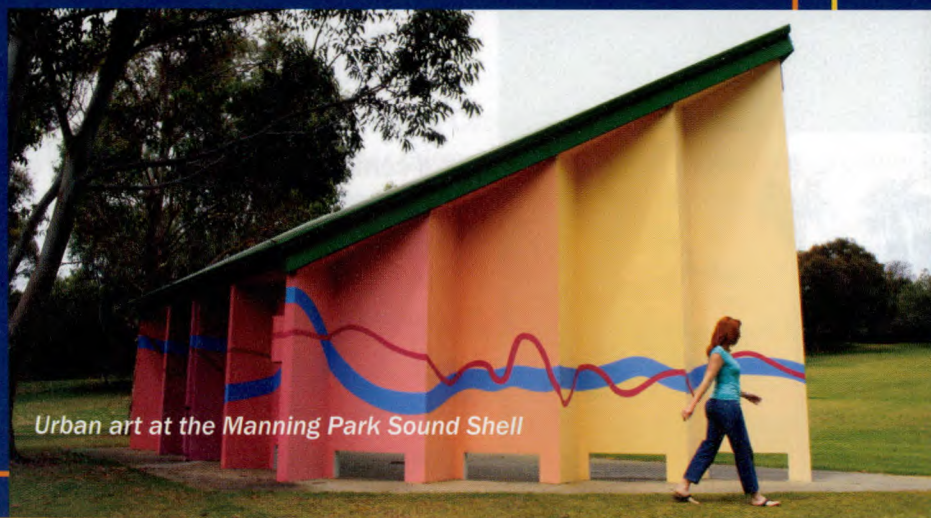
Urban art at the Manning Park Sound Shell