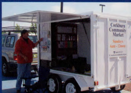
Mobile Community Information Centre

The mobile Community Information Centre provides the opportunity for community groups of all interests to display their brochures and have the Centre at their events. Access to the trailer can be made by contacting your local residents association. The Community Information Centre also doubles as a fundraising facility that comes equipped with BBQs.