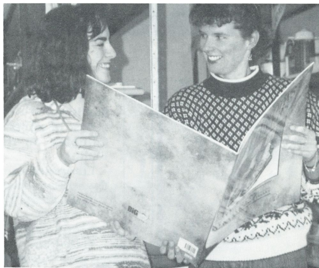
■ Family Day Care fun.

Regular training programmes for care providers are held. All care providers have a Senior First Aid Certificate and the majority