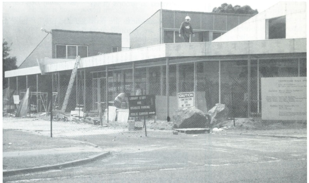
■ Coolbellup new library during construction.

For more information, contact the Lakes Complex staff on 417 3003.