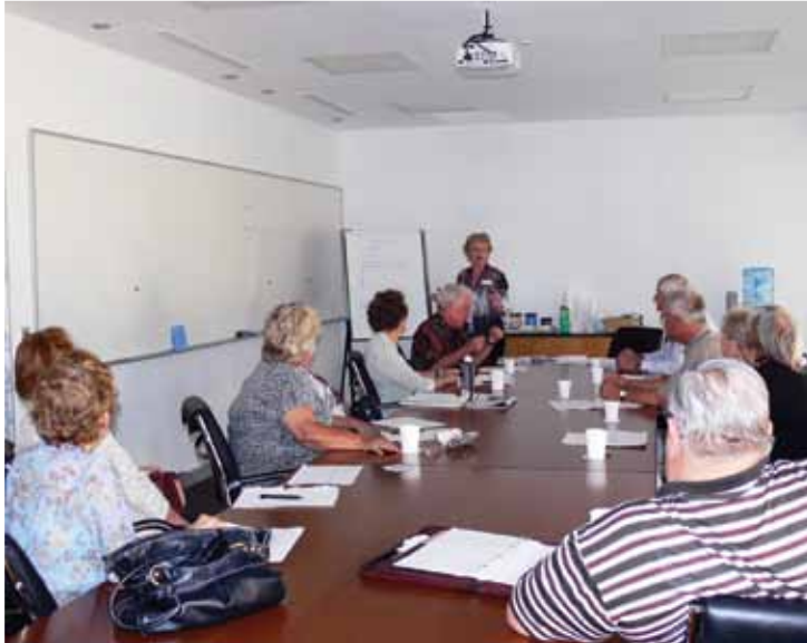
Above: Working on a Revitalisation Plan

If you are interested in some fun and friendship, enjoy excursions, guest speakers, morning tea and a chat – look no further than the Probus Club of Cockburn. Originally, the PROBUS came from Professional and Business, however times have changed.