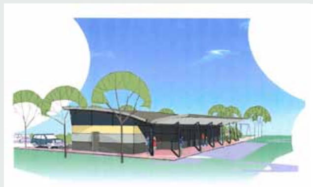
Botany Park Sports Pavilion

All these facilities will be valuable local resources as Cockburn continues to establish itself as a hub of industry, business and residential growth.