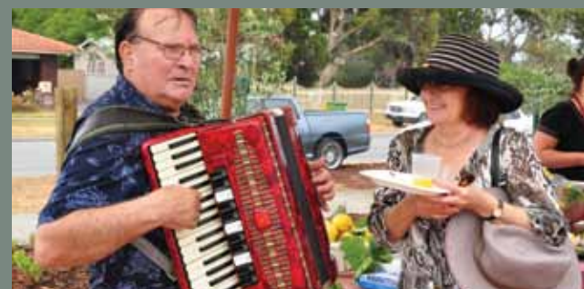
Šolta Park Opening.