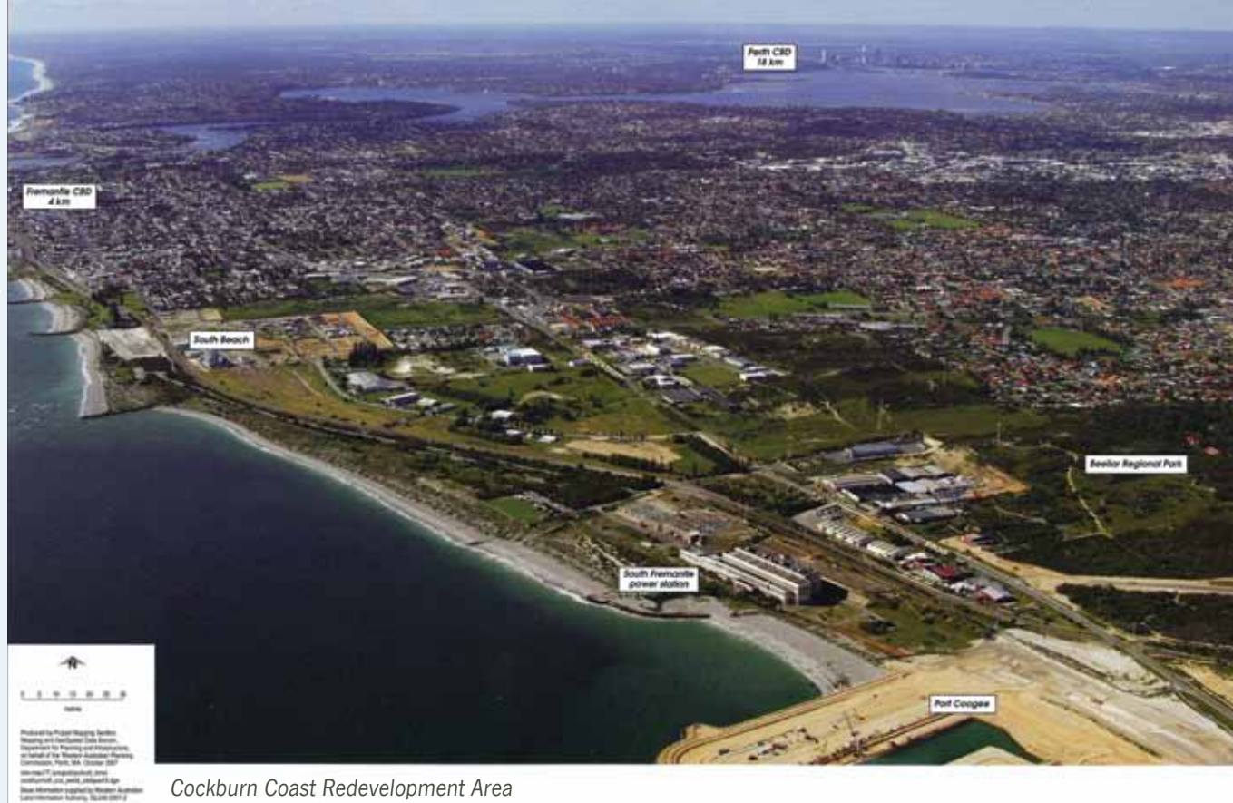
Cockburn Coast Redevelopment Area