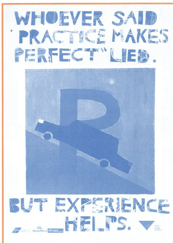
The winning entry for WA's Road Awareness Campaign for pre-probationary drivers.

"There were a lot of messages about drink driving and lack of experience," RoadWise Project Officer