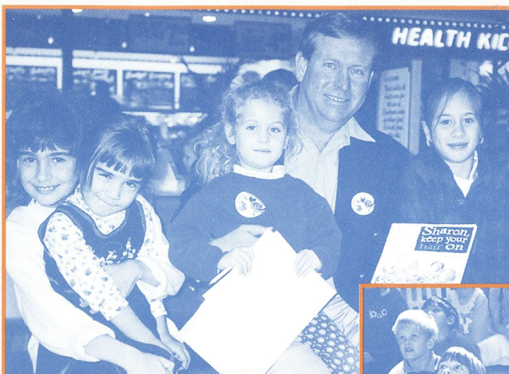
Left: Minister for Education, Colin Barnett MLA, with some Bookworms at the launch of Children's Book Week for Cockburn.

Some of her more famous books include 'Lucy in the Leap Year' which was awarded an Honour book for Children's Book Council of Australia and 'Five times dizzy', which has been made into a television series.